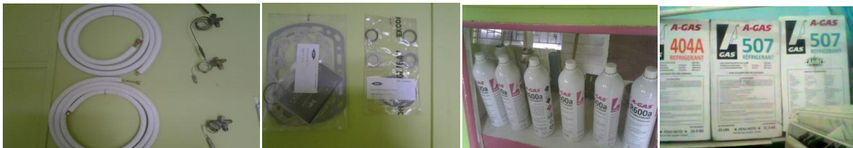
Suppliers of refrigeration spares and consumables