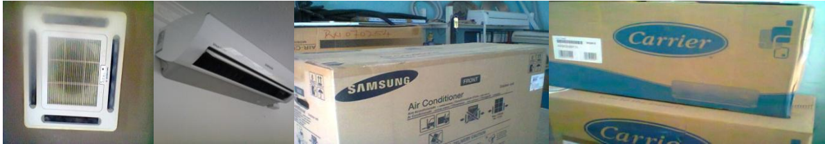
Suppliers of various Air conditioning units from reputable manufacturers