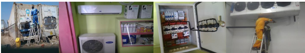
Designing, repair, service and installation of all types of HVACR equipment

STAND No. 34, PRESIDENT AVENUE NORTH P.O. BOX 73058 NDOLA, ZAMBIA.