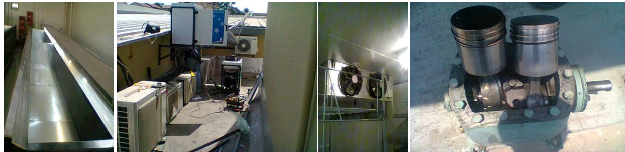
Renovations and installation of freezer rooms, chill rooms and other cold storage facilities.